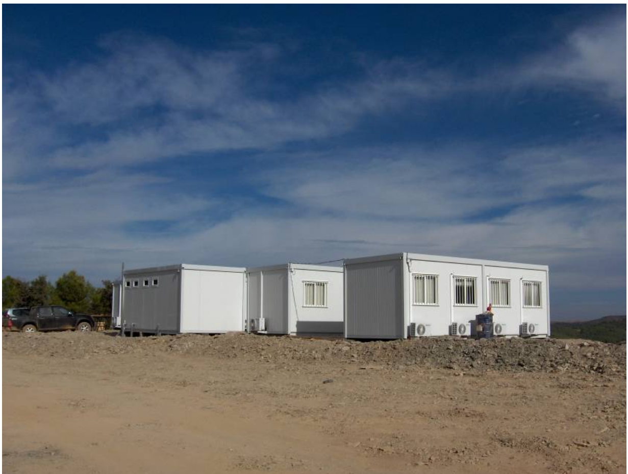
FIGURE 3 EXPLORATION CAMP AND OFFICE AT ACHMMACH

Office and on-site camp accommodation was built and commissioned during the quarter. This is now the exploration base at Achmmach and will be used to support exploration at El Karit and other regional targets.