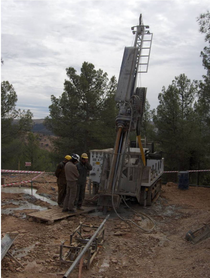
FIGURE 1 DRILLING HOLE AD003