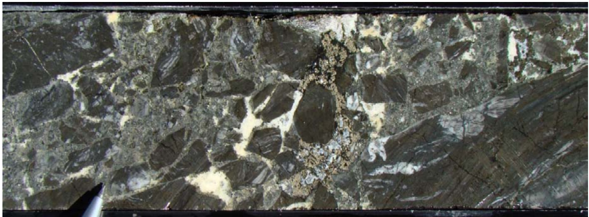
Figure 2 Hydrothermal Breccia with Tin in Cement AD028 241.3m

Note: assays based on HQ core with 0.3% Sn cut-off and ≤ 3m internal down hole dilution used